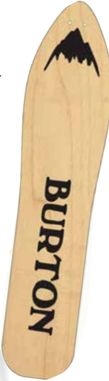
Burton snowboard, £120, burton.com

Winter sports are nothing without nature. The mountains, the snowfall, the wildlife – they must all be protected. And the industry is stepping up, with Swiss resorts setting the standard. At Lagom's chalets in Verbier and Zermatt, decide whether you need toiletries, how often you'd like linen laundered and whether to carbon-offset your trip. In November's World Ski Awards 2019, carbon-neutral crashpad Valsana took the title of World's Best Green Ski Hotel 2019 (it assists guests with tree-planting and off-setting) and in 2020 Laax plans on being the first self-sufficient resort while remaining one of Europe's best for big-air seekers and freeriders. Colorado's family-owned,