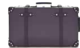
Globe Trotter suitcase, £2,535, globe-trotter.com

Scott Dunn has created the ultimate itinerary, too, with a 34-day ski safari touring five countries