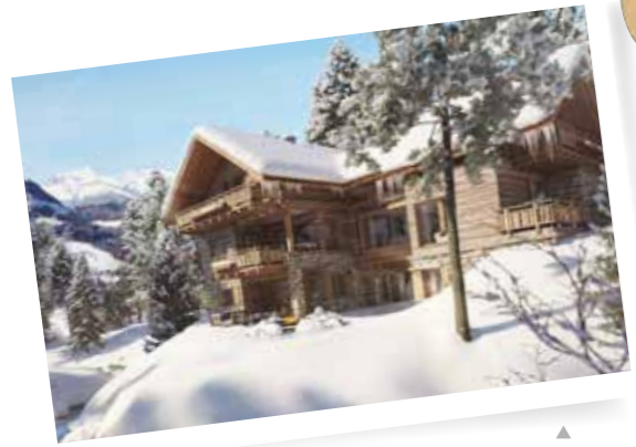
▲ Six Senses Kitzbühel will be the wellness group's first resort in the Austrian alps

levlagon.com ; valsana.ch ; flimslaax.com ; wolfcreekski.com ; sixsenses.com