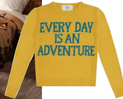
▲ Alberta Ferretti has teamed up with the eco-warriors at Eco-Age to create a line of sustainably made knitwear made from 100 per cent wool, spun using renewable energy, and GRS certified recycled cashmere created in Prato, Italy. From £390, harrods.com