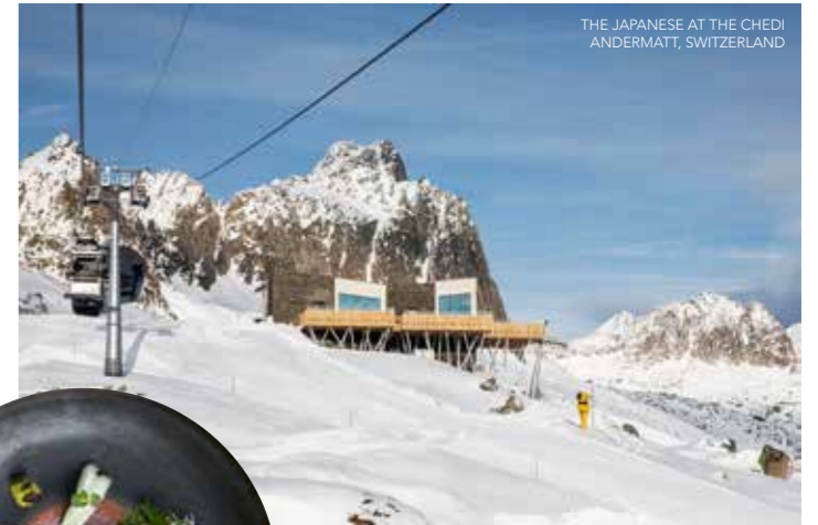
THE JAPANESE AT THE CHEDI ANDERMATT, SWITZERLAND