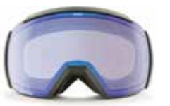
Hemisphere goggles, £110, zealoptics.com