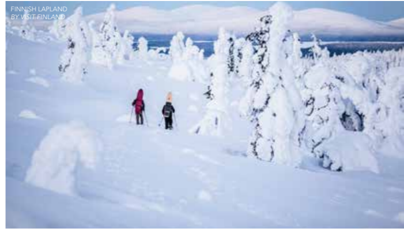
FINNISH LAPLAND BY VISIT FINLAND