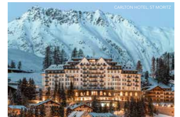
CARLTON HOTEL, ST MORITZ

from Aspen to Iceland, and a heli-ski ocean voyage will take adventure addicts through virtually-untouched terrain in Antarctica which will take place in 2021 (spaces are limited and tickets are on sale now).