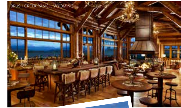
BRUSH CREEK RANCH, WYOMING