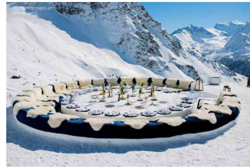
LEO TRIPPI'S CHEFS AT NEW HEIGHTS