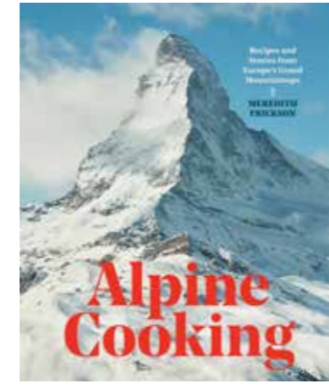
◀ Meredith Erickson's guide to Europe's alpine kitchens is filled with recipes for comfort food and stories from the mountains. £30, waterstones.co.uk

leotrippi.com ; badruttspalace.com ; severins-lech.at ; armancette.com ; chabichou-courchevel.com ; lecoucou.com