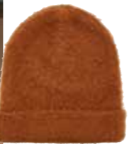
Acne beanie, £130, matches-fashion.com