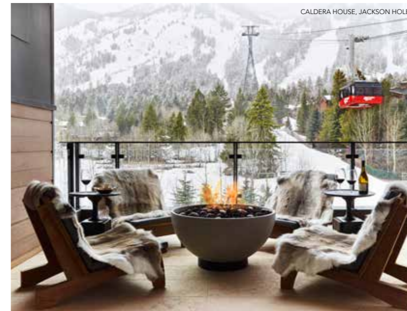
CALDERA HOUSE, JACKSON HOLE